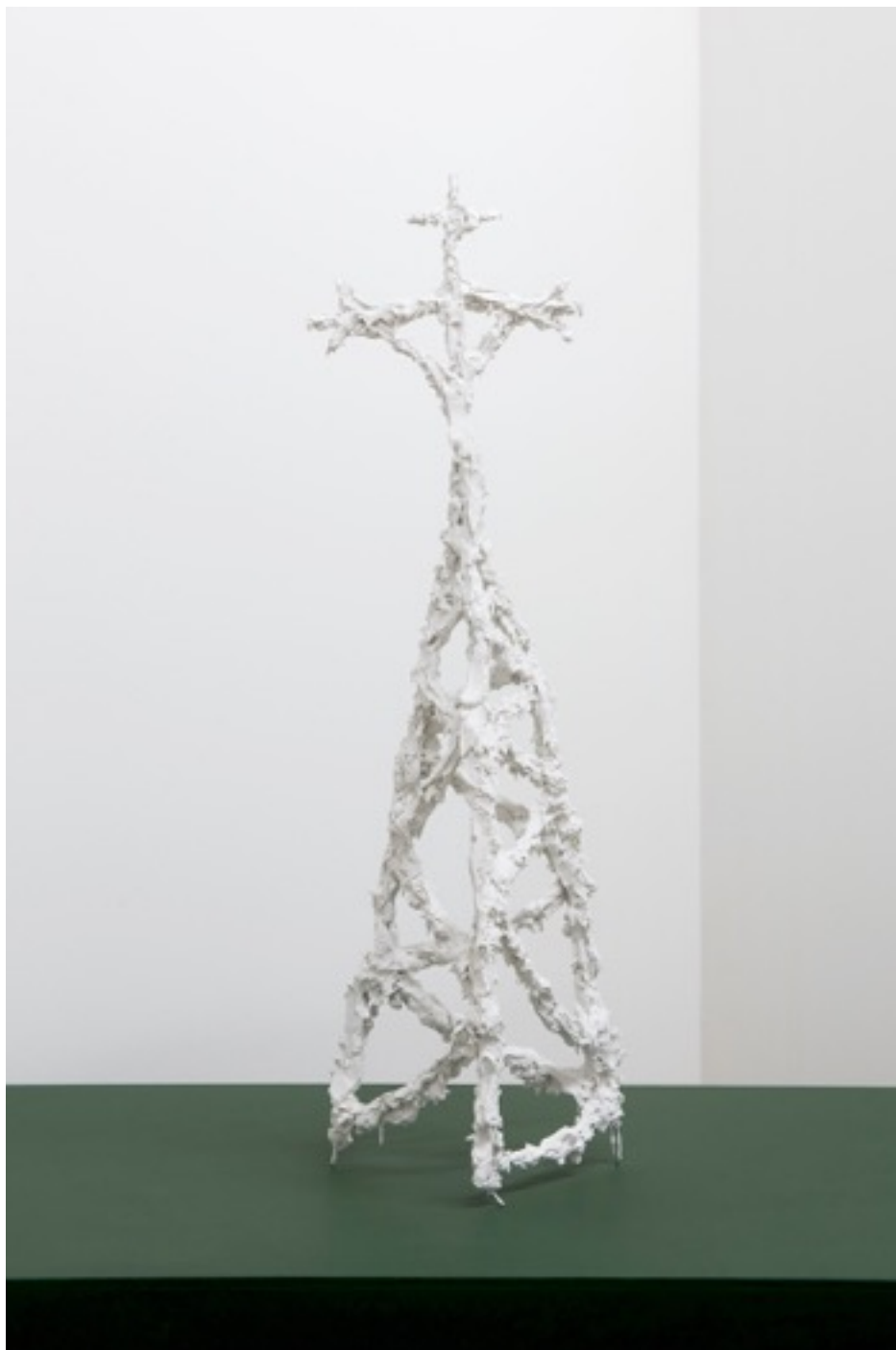
Pylon (Lord) 80 x 25 x 17 cm