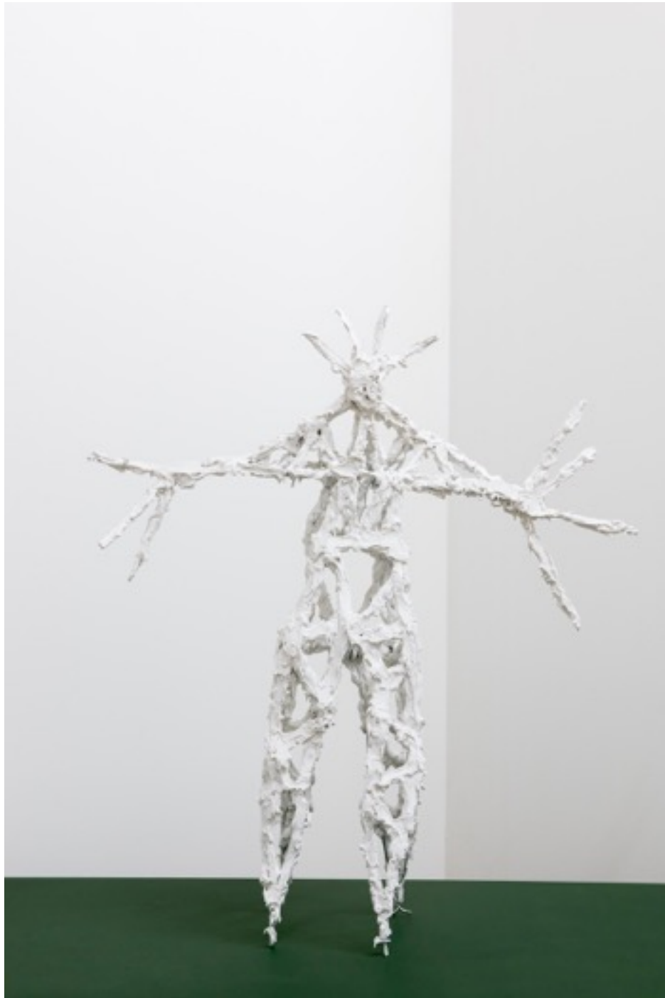
Pylon (King) 78 x 69 x 22 cm