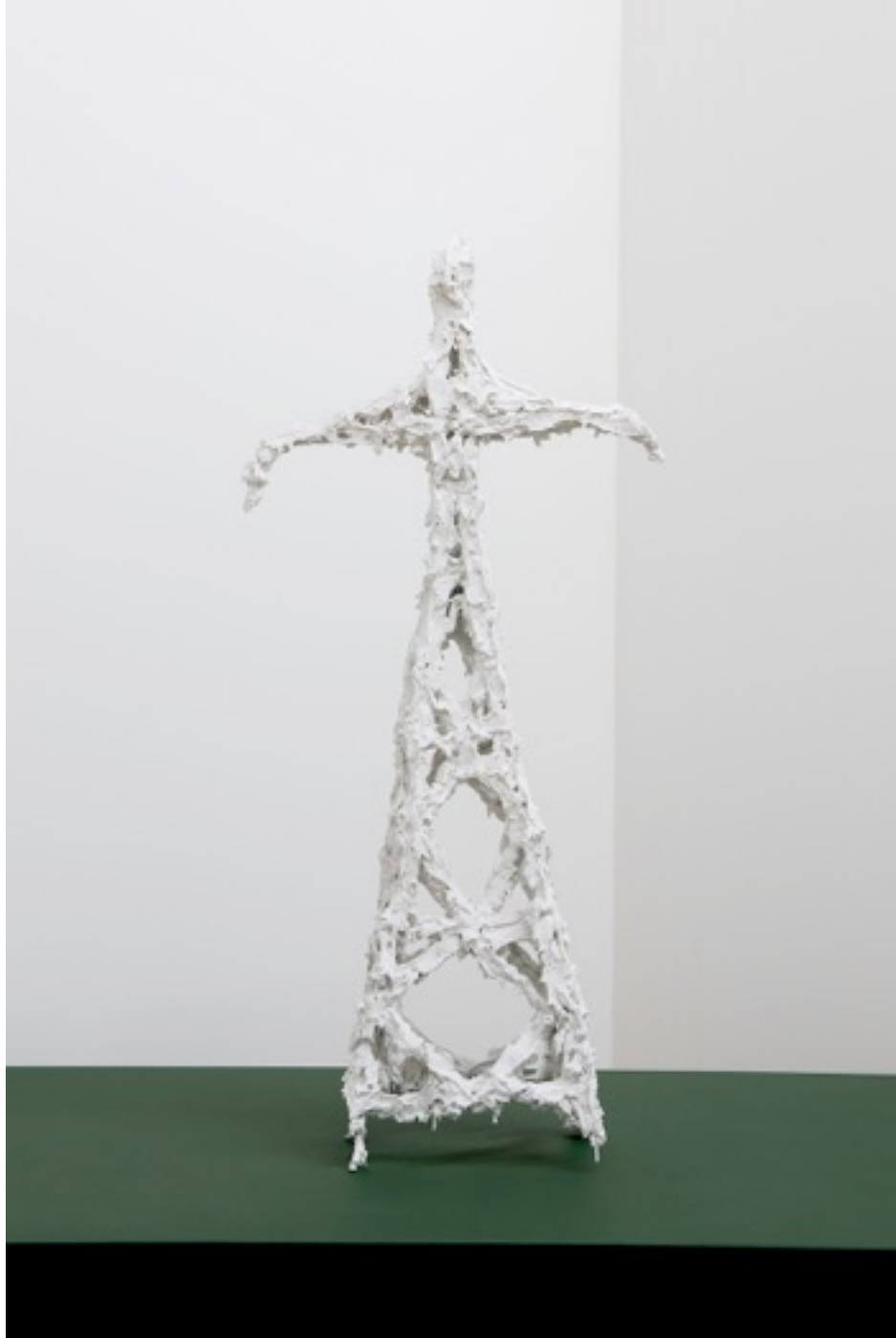
Pylon (Serf) 80 x 37 x 13 cm