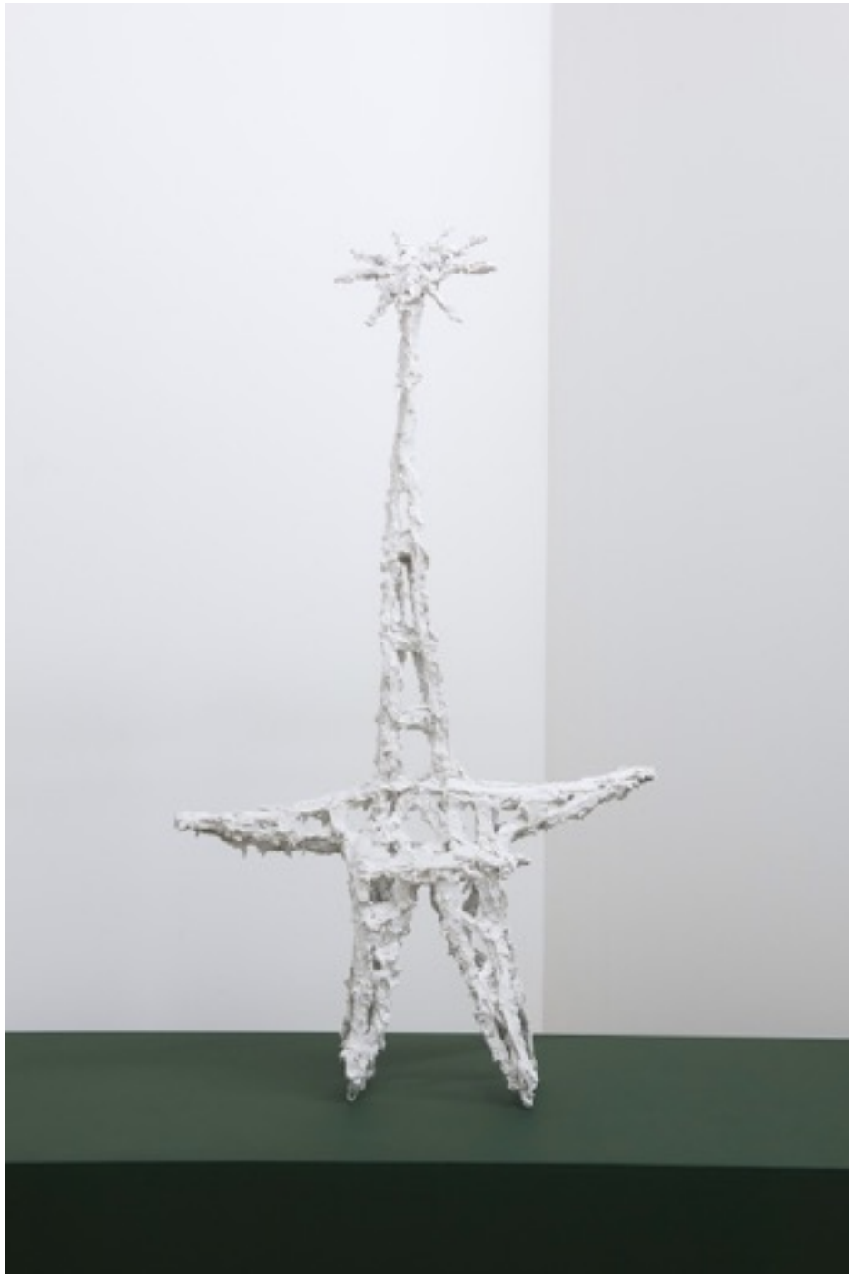
Pylon (The Speaker) 110 x 60 x 13 cm