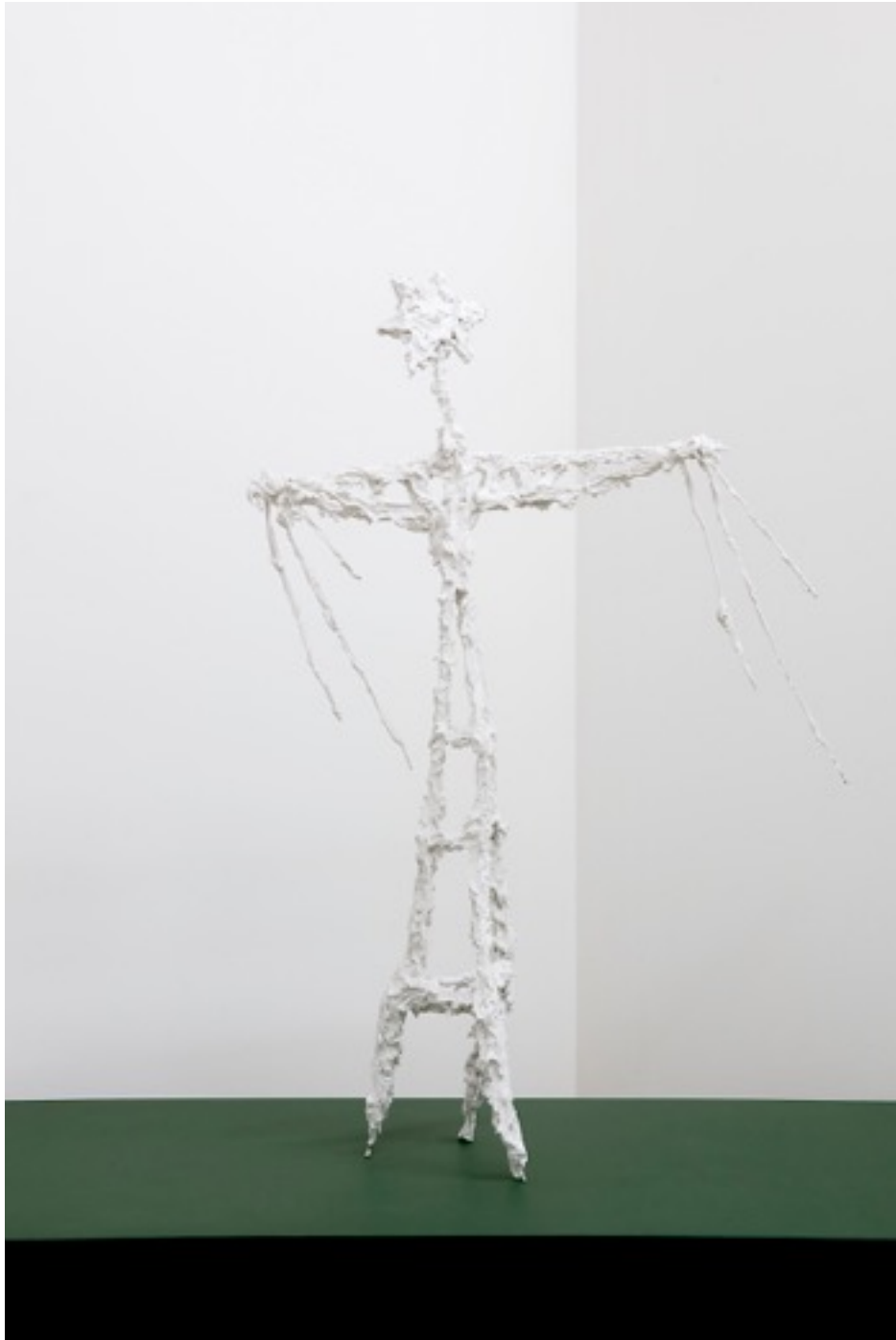
Pylon (Reaper) 100 x 60 x 26 cm