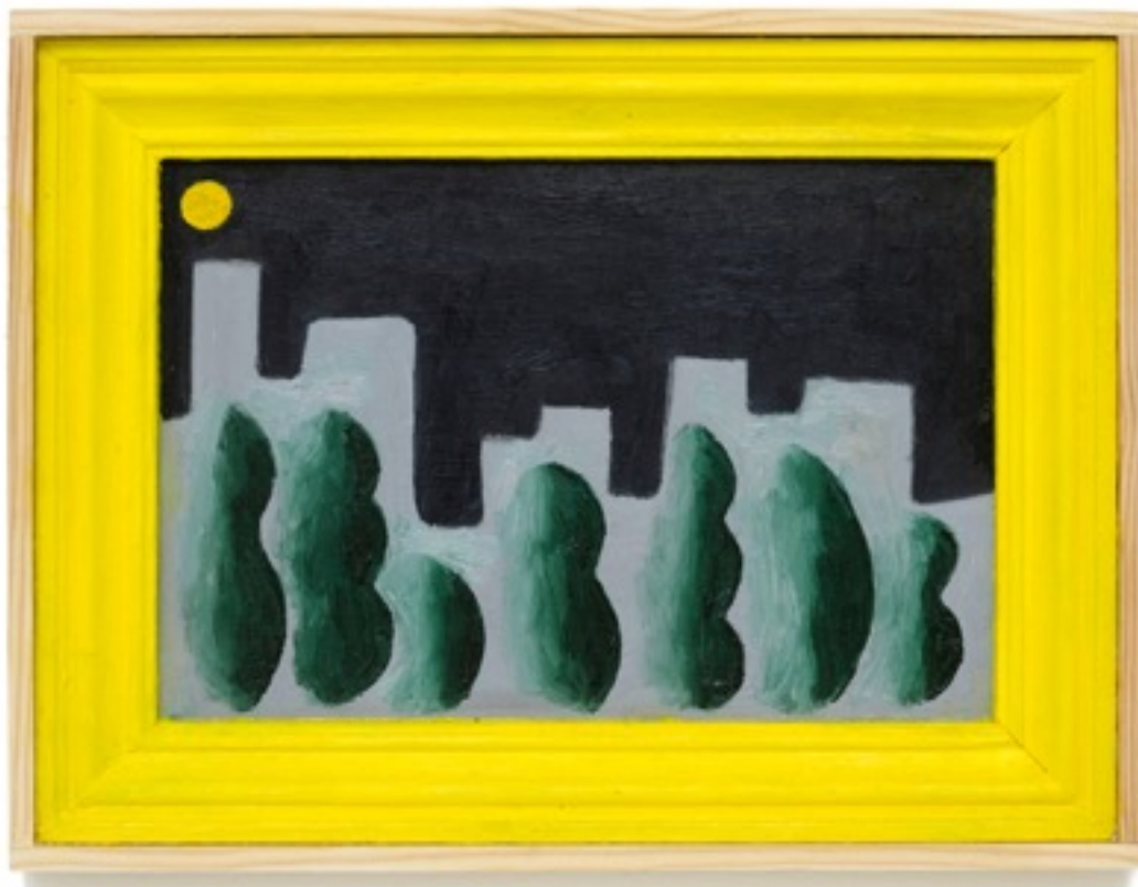
New Town oil on shaped wood, 2020 30 x 23 x 3cm