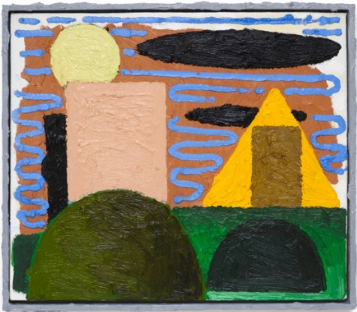
Conspiracy Shapes Oil on canvas & wood, 2020 42 x 37 x 3cm