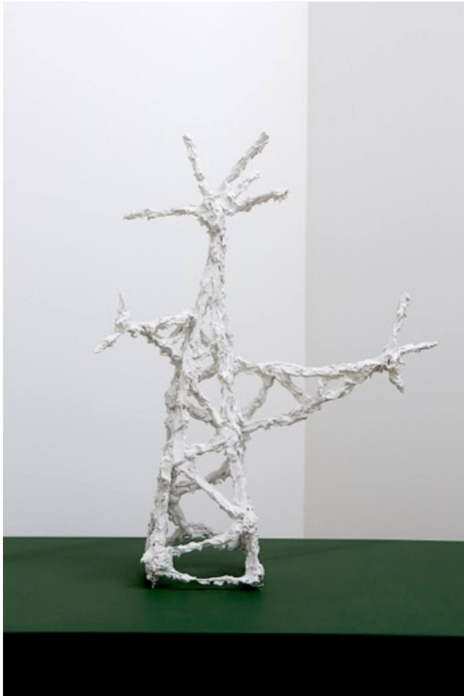
Pylon (Catcher) 73 x 57 x 23 cm