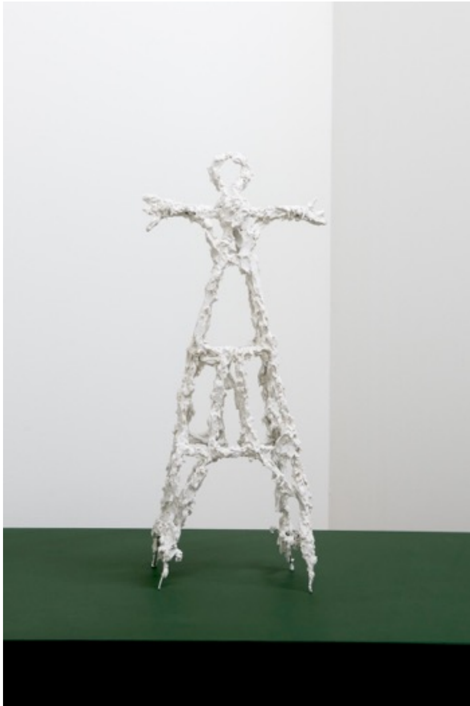
Pylon (Scout) 59 x 26 x 14 cm