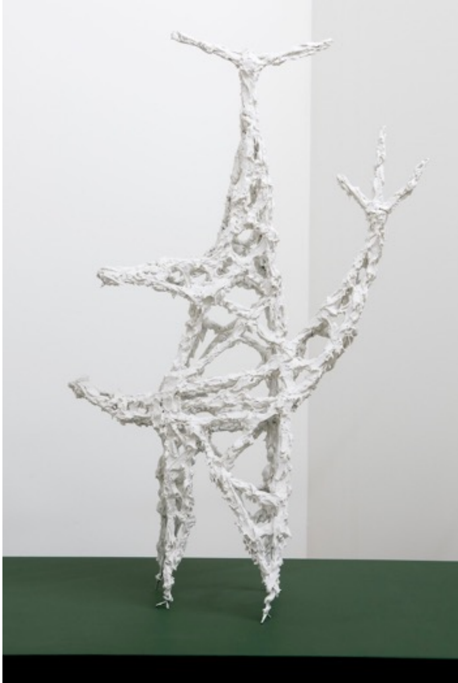
Pylon (Butcher) 52 x 88 x 21 cm