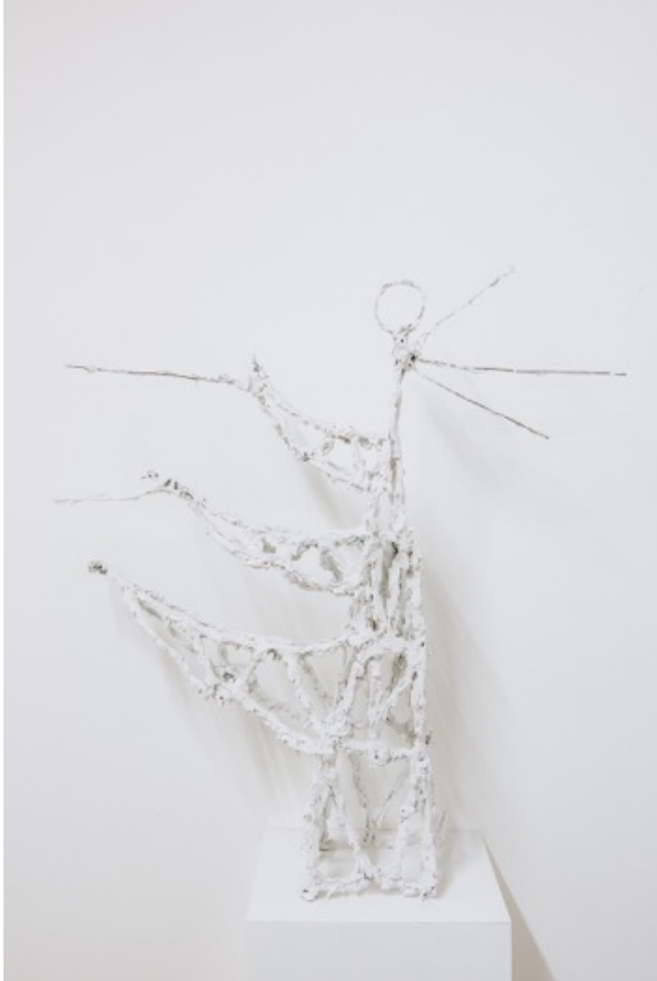
Pylon (Angel) 75 x 74 x 21 cm