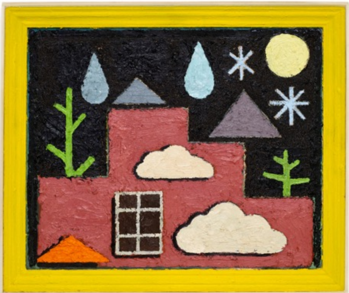
Citadel Oil on shaped wood, 2020 53 x 46 x 3cm