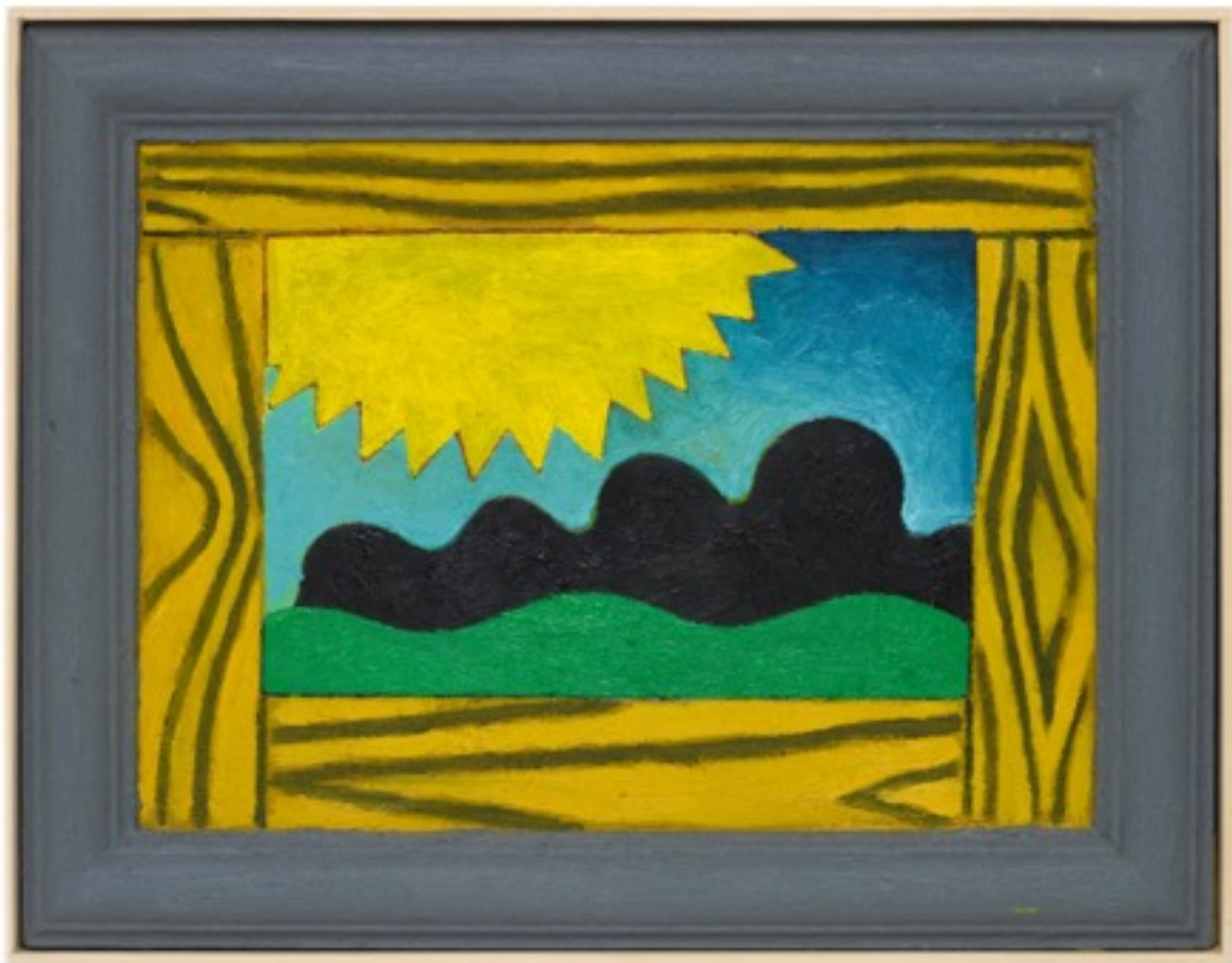
The Shadow Oil on shaped wood, 2020 36 x 28 x 3 cm